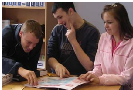
Participants from Rathbone UK, May 2007

Alongside these full accredited courses we have run taster sessions for, The Probation Service, FortAlice & Halliwell Ucan Over 50's Group