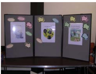
Above: Think Tank Right: Past participants taking part in 'Vote With Your Feet'

Participants take part in activities around consequences of non payment for priority debts, such as rent arrears and council tax. Information provided about making arrangements to pay creditors and where to go for advice if you are struggling to make payments. There is also an activity involving Bailiffs and what they can and cannot do under the law.